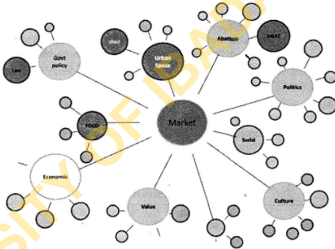
Figure 2: Networks of power relations mapping among actors/respondents involved in foodservices and waste management issues in the study area based on emerging themes from the case interview.

And this can clearly be translated into the urban environmental situation that involves the roles of both human and nonhumans in shaping the built environment especially as suggested in the research findings as shown in figure 2 and also later in table 1.