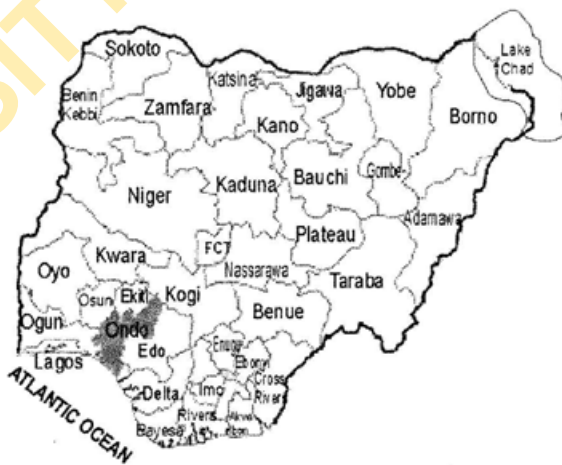
Figure 1: Map of Nigeria.

As earlier state, the study area is located in Akure, Nigeria (see figure 1). Nigeria is a country of over 150 million people; situated to the south between the