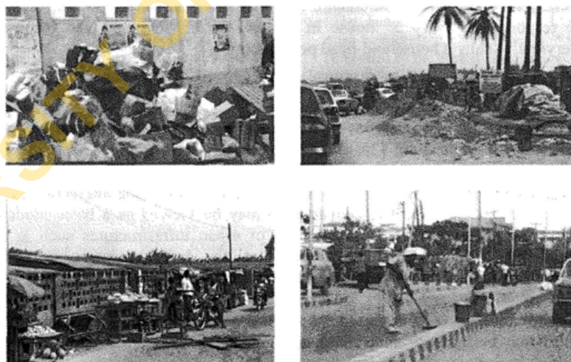
Figure 3: Environmental management problem, garbage and food waste in relation to the foodmarkets and mitigating efforts by the community.

Urban transformations mirrors the complex nature of the society which has social implications, such the general attitude to hygiene, sanitation control and environmental consciousness of the urban populace (this can be compared to the apathy exemplified in pictures – see figure 3). It has been argued that it is practically impossible “to pry apart social, cultural and economic relations” [24]. Therefore, this paper argued that the process that shapes for instance attitudes towards waste handling, disposal and management has a strong link to the way societies were organised. Urban growth or transformation is not an inevitable phenomenon, but rather an unpredictable occurrence based on existing social,