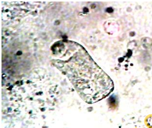
Plate 1c. Telotroch of Vorticella sp x 100

Plate 1a and 1b : C – Cilia, F – Food vacuole, SC – Scopula, ST – stalk, PL – Peristomial lip, PD – Peristomial disc, Z - Zooid