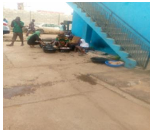
Figure 6: (Gut cleaner at work)