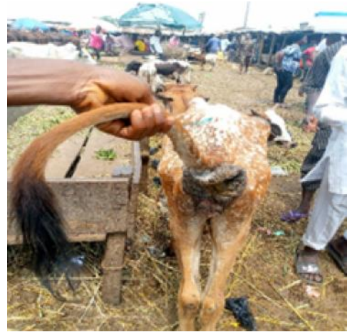
Figure 4: (budded, bleeding infected anus)