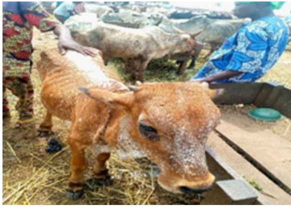
Figure 7: (Infected cow and carefree handlers)

The implication of this result is that nature of work is a strong predictor of bacterial infections of abattoir workers. On the other hand, gender does not necessarily determine bacterial infections of abattoir workers.