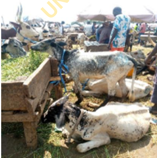
Figure 5: ( Sick , malnourish with septic skin blister)

contribution to the bacterial infections of abattoir workers. However, the table indicates that gender ( \beta = -0.067 ; t = -0.649 ; p > 0.05 ) have no significant relative contribution to bacterial infections of abattoir workers.