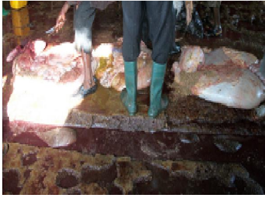
Plate 4a. Meat dressing on killing floor