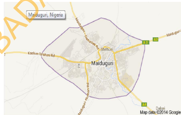
Figure 1: Map of Maiduguri

main abattoir is located on longitude 013.10719°E and latitude 11.51519°N. Maiduguri is the capital of Borno state, located in the North East region of Nigeria and is situated at 11.85° North latitude, 13.16° East longitude and 300 meters elevation above the sea level (Figure 1). Maiduguri also called Yerwa by its locals is the largest city in Borno State located in the northeastern region of Nigeria having a population of about 1,112,449 inhabitants. The city sits along the seasonal Ngadda River which disappears into the Firki swamps in the areas around Lake Chad (Encyclopaedia Britannica). The abattoir was chosen because it was one of the main abattoirs in the North-eastern Nigeria with high volume of animals slaughtered there. Constant regular visits (two days a week) were made to the abattoir in order to survey the state of the facilities, sanitary conditions and practices in the abattoir. Materials such as boots, cover all, hand gloves, N-95 respirator, disinfectant and soap were used for personal protection. Data were collected through on-site observations and were documented accordingly.