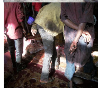
Plate 5a: Butchers in the abattoir and premises bare-footed, wearing slippers