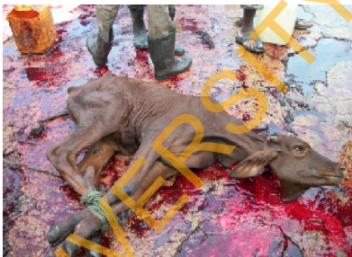
Plate 6a: slaughtered calf

Routine slaughtering of calves and pregnant animals characterized the abattoir with quite a number of fetuses recovered on a daily basis. More females are slaughtered when compared to the males as they are usually cheaper with some of them either old or sick and highly emaciated (Plates 6a-c).