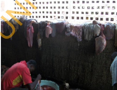
Plate 4e. meat hung on the wall