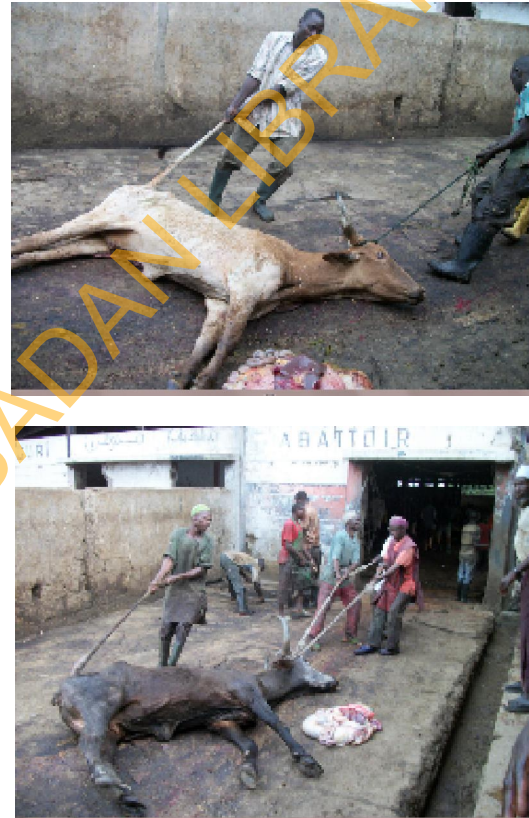
Plates 3a & b. Cows dragged on the floor taking into the abattoir for slaughter

was a case of a butcher who was attacked on the chest by an aggressive bull. Live animals were dragged on the floor to the point of slaughter when they refused to walk (Plate 3a & b). Sheep and goats were tied in the wheel barrow and wheeled into the abattoir premises. The camels were directed to the place of slaughter by beating. Stunning of animals before slaughtering was absent due to the religious beliefs and culture of the people. Killing is done on the floor (Halal method of slaughter). Animals in the Maiduguri main abattoir are slaughtered in the Islamic way.