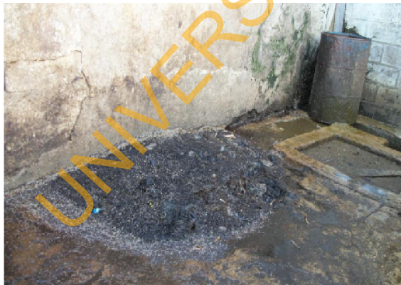
Plate 1a. Accumulated dirt with a lot of maggots on the floor just outside the main abattoir Building

The hygiene status of the abattoir was quiet poor. Although there was evidence that the abattoir was being washed, no detergent and disinfectants were used. In fact, there were cases of water shortage when only minimal washing with the available water would be done, making the place stinking and unkempt. Often times, the drainages in and around the abattoir were clogged with abattoir debris hindering free flow of effluents and thereby leading to accumulation of maggots which often migrated onto the killing floor (Plate 1a). In addition, butchers and other abattoir workers were sometimes seen spitting on the floor constituting nuisance and health hazards to those working within the abattoir and meat consumers as well. Some animals like cattle and camels were also slaughtered on the slab outside the main abattoir building (Plate 1b).