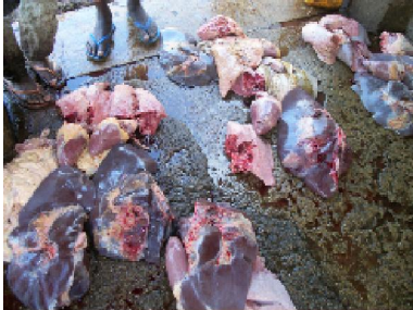
Plate 4b. Visceral organs on dirty floor