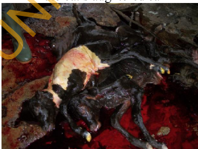
Plates 6b: fetuses from slaughtered pregnant cows