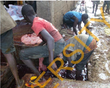
Plate 4d: Washing of stomach in the dirty gutter before finally being washed with clean water