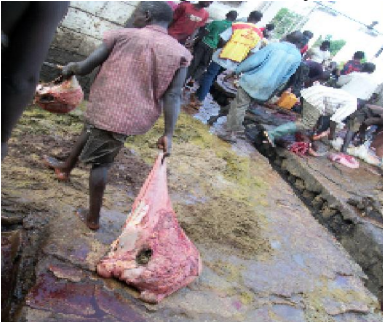
Plate 4c: Stomach dragged on the floor