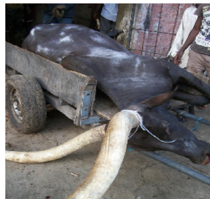
Plate 2b. Moribund bull brought for slaughter 3.3.2 Postmortem inspection