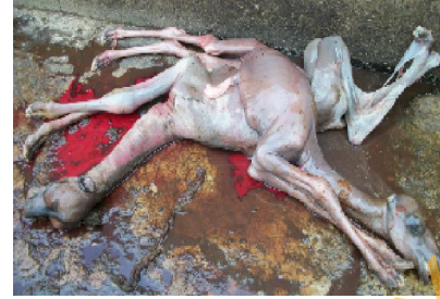
Plate 6c: fetuses from slaughtered pregnant camels