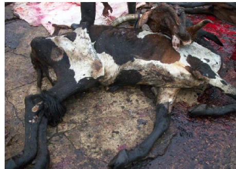
Plate 2a. Slaughtered cachectic cow

There was no ante-mortem inspection of animals carried out and animals were often brought in tied with ropes and chased into the abattoir. All sort of diseased, cachectic and moribund animals were slaughtered in the abattoir (Plates 2a & b). Sometimes, dead animals slaughtered during transport were brought to the abattoir for dressing because the animals could not make it to the abattoir alive.