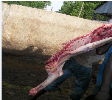
Plate 5b: Butchers carrying meat on their backs to the meat stand