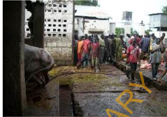
Plate 1b. Slaughtering of animals outside abattoir building