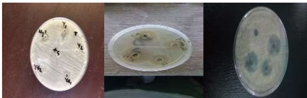
Figure 2: Selected culture plates of the isolates of Lactobacillus plantarum with their zones of growth inhibitions on tested isolates of Escherichia coli that were resistant to standard antibiotics.

cotrimoxazole (25 \mu g), chloramphenicol (30 \mu g), gentamicin (10 \mu g) and ciprofloxacin (5 \mu g). The plates were incubated aerobically at 37°C for 24 hours before measuring the diameters of zones of growth inhibition observed. Sensitive and resistant strains were marked S and R respectively as standardized by Clinical Laboratory Standard Institute. [14]