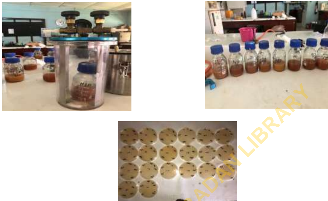
Figure 1: Microaerophilic incubator jar with culture plates, specimen bottle with MRS broth and pre-incubated culture plates.

standardized suspension, drained, and used for inoculating Mueller Hinton agar (Oxoid, UK) on a 100-mm culture plate.